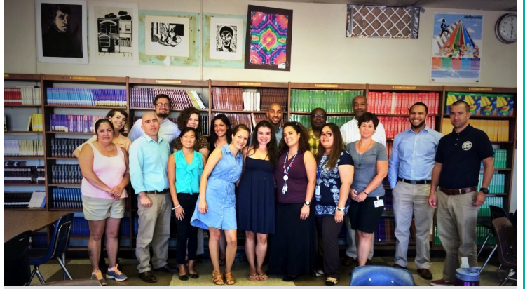
Community partners gather for a photo at Penn Treaty School.

Supporting public education in Philadelphia by forging connections between neighborhoods schools and community partners.