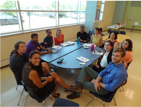
Members of the 2015-16 PHENND VISTA cohort during orientation.

Community Partnerships Coordinators are AmeriCorps VISTAs who work to facilitate communication between neighborhood schools and community partners. They do this through convening monthly partner meetings at the schools, creating and maintaining multiple platforms for written and electronic communication between partners and school staff, conducting a needs assessment in collaboration with school leadership, and recruiting new partnerships to address those needs.